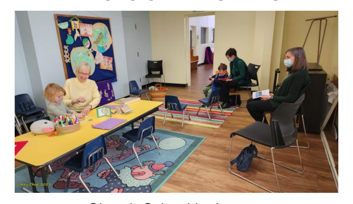
Church School in January