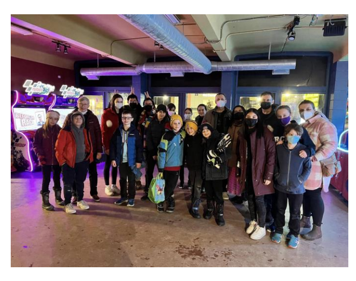
Youth Lazer Tag