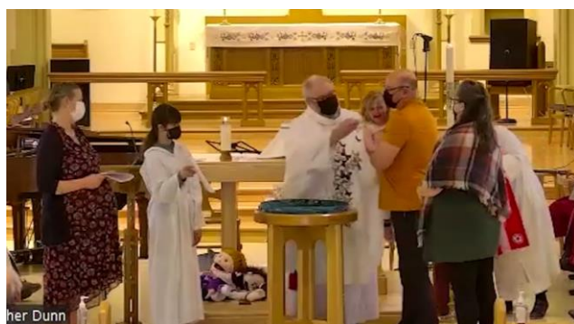
All Saints' Day and Remembrance Sunday November 6th