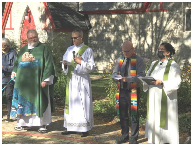
The Blessing of the Animals Celebration on October 2 nd in the Courtyard