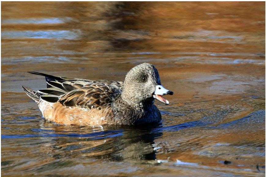
The female American Wigeon at Mud Lake, Ottawa

School-aged children who come to church will be invited to join us in Rm 7/8. Everyone will be distanced and masked. The nursery is closed, so children who are too young to attend school may join us, but you will be required to stay with them in the hall.