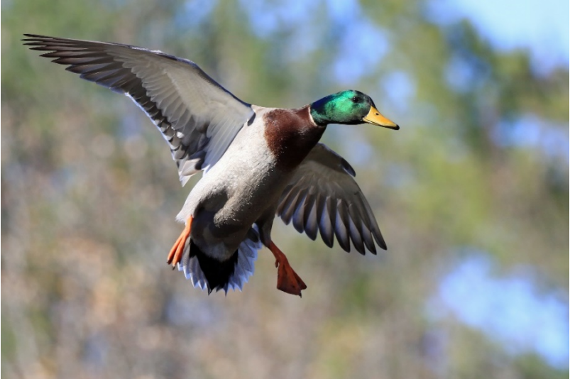
The male Mallard coming in for a landing at Mud Lake, Ottawa

Incarnation rests in us. The following Zoom coordinates will be the same for every evening: https://us02web.zoom.us/j/83980088746?pwd=MWhucURhZDNJbCt2TUJNeFFOSHZ3Zz09 (Meeting ID: 839 8008 8746; Passcode: 684063)