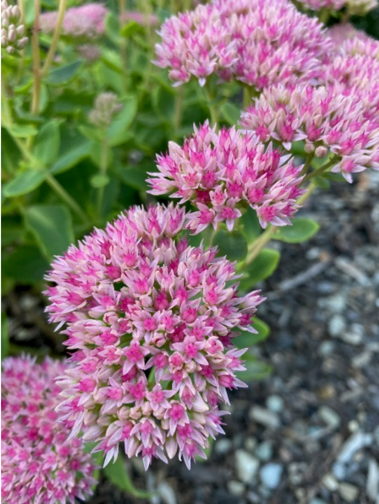
Fall blooms in Britannia Bay

If you'd like to register to attend next Sunday, September 19 th , the best way to do so is to fill out the online form, on the All Saints' home page ( https://www.allsaintswestboro.com ), starting on Monday, September 13 th , after 9:00 am and ending at 12:00 noon on Friday, September 17 th . However, if you do register by calling the church office, please make sure to leave a voicemail, indicating that you would like to register, as well the day and time of your call.