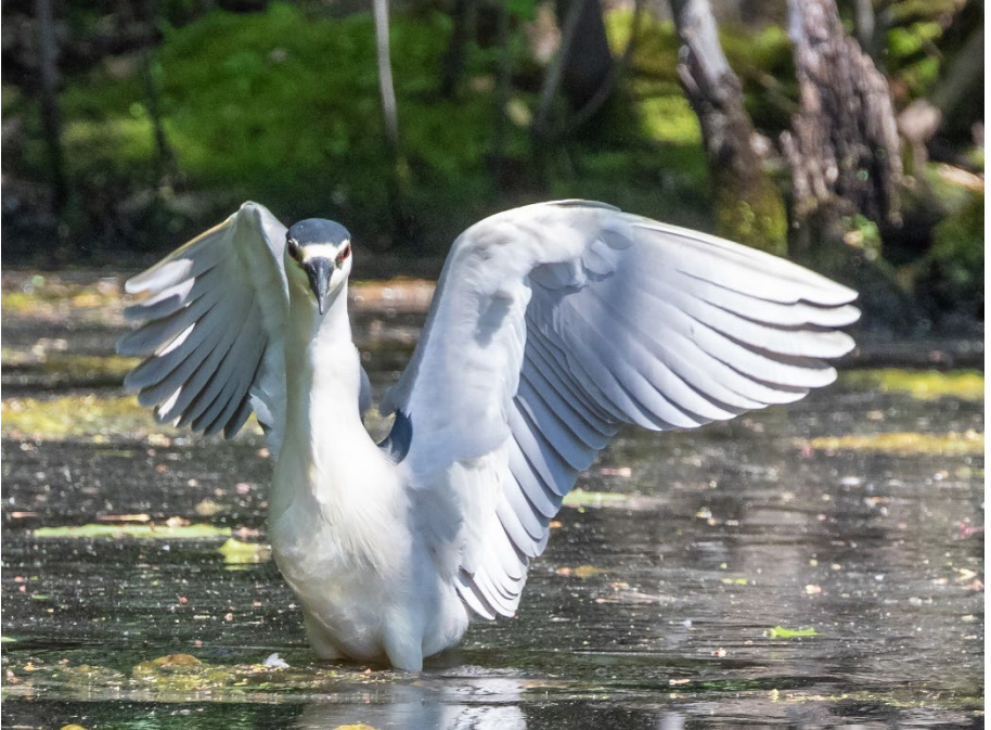
The Black-crowned Night Heron, Mud Lake, Ottawa