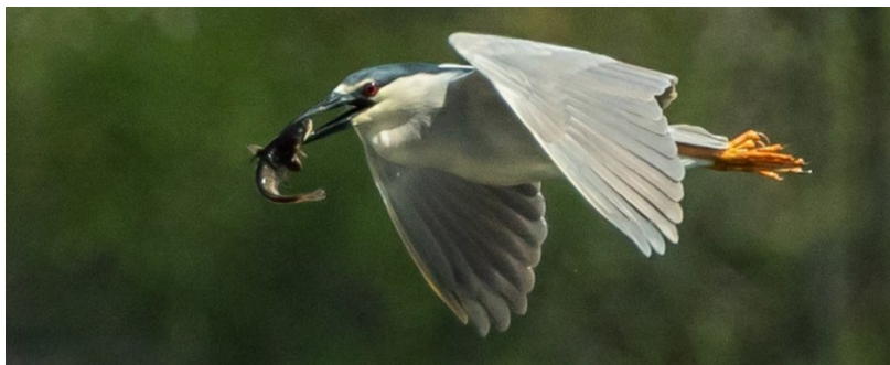
Black-crown Night Heron brings an offering of fish, Mud Lake, Ottawa

All Saints Anglican Church Westboro's Church One License Number is A-728801