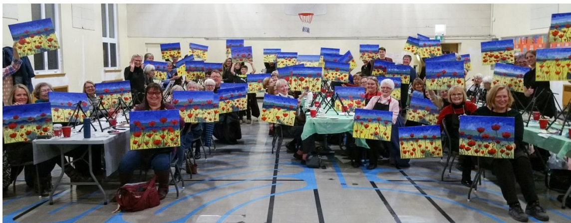
The “Paint Night” in support of Cornerstone in November (below)