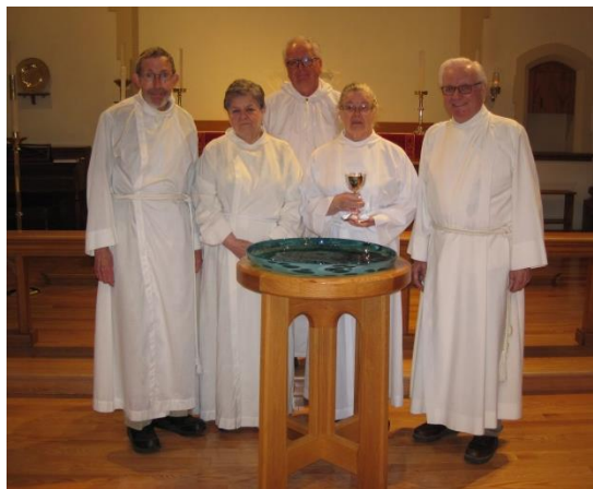
Diaconal Ministers (above)

provide as well as the kindness of our parishioners. Thank you so much. If there is a Westboro Fuse weekend in 2018 it will need to be organized by someone other than the Parish Incumbent!