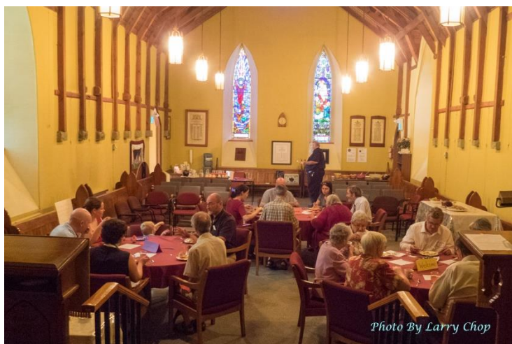
The Newcomers Lunch on September 17 th (on the left)