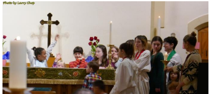
The Children toured the worship space as part of the Intergenerational Service on February 24th