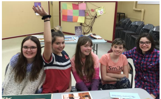
Members of the Confirmation class gathered March 2 nd